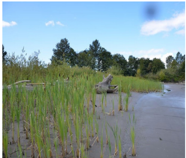
Site conditions, looking downstream (2021)

Through partnerships with the Fraser River Harbour Commission, Fisheries and Oceans Canada and Simon Fraser University, the Timberland Basin Habitat was proposed as a site to study marsh establishment and to compare factors related to marsh establishment such as natural colonization of vegetation versus marsh transplantation. This site has been providing productive fish and wildlife habitat on the south arm of the Fraser River for over 30 years. The port authority conducts regular monitoring to ensure the habitat continues to meet its biophysical objectives.