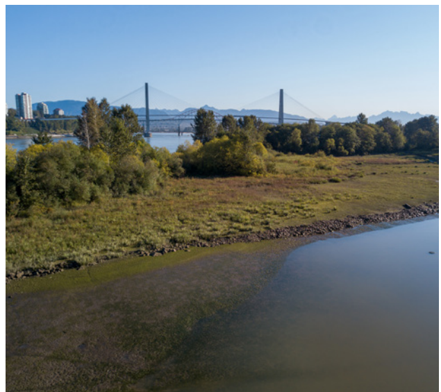
Aerial view of a downstream section of the project site (2021)