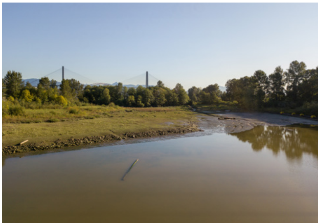
Aerial view of the upstream part of the project site, looking northeast (2021)